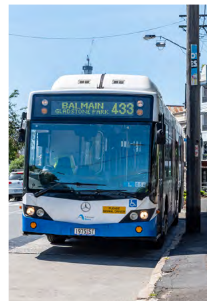
Left: Buses will provide connections to surrounding communities.