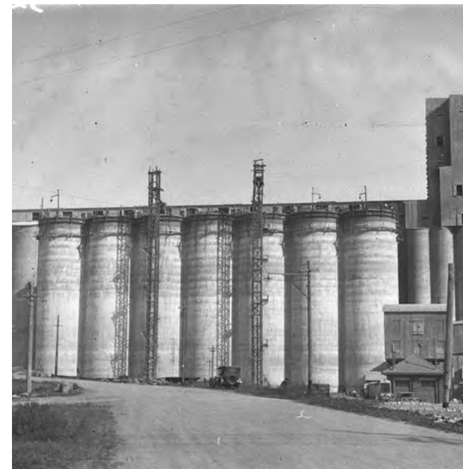
Above: The original Glebe Island Silos as photographed in 1934.

There was a desire to understand how differing interests will be preserved as the precinct develops over time. The draft Bays West Place Strategy was recognised as a framework for the public and private sector to work collaboratively. It was suggested a lead agency be identified to oversee the project.