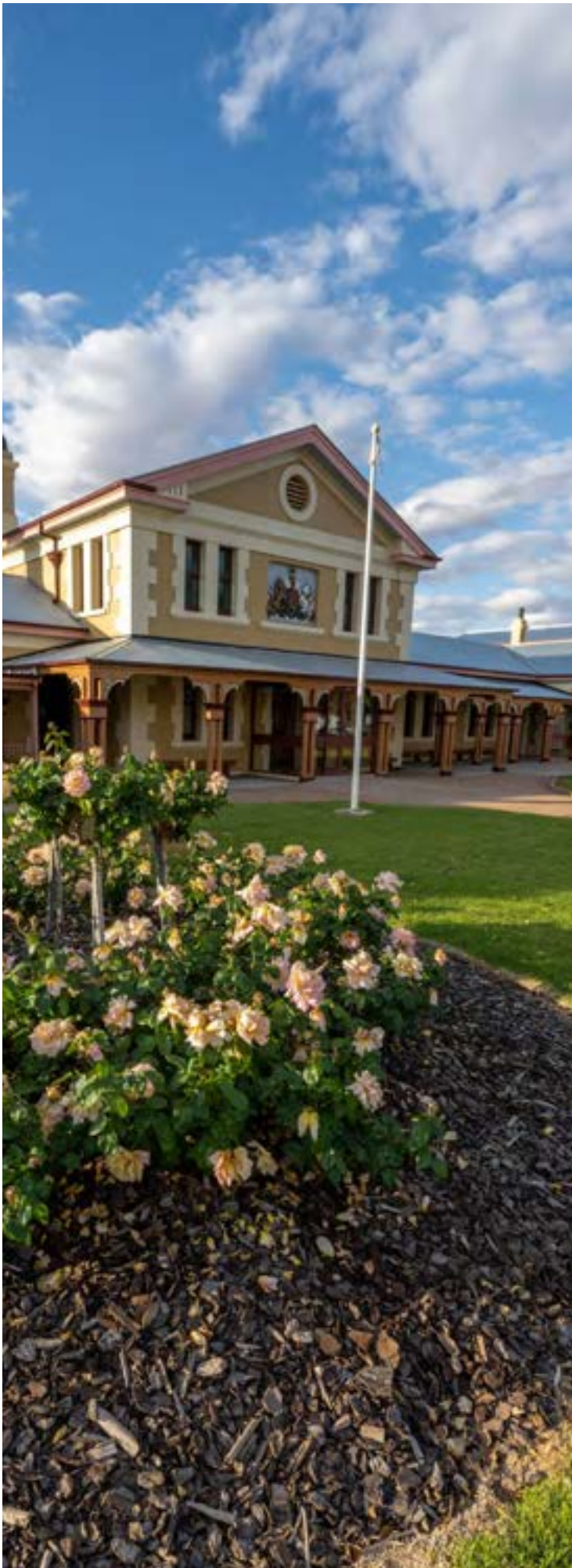
Location: Broken Hill Courthouse and gardens located on Crown land