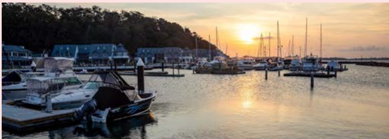
Location: Port Stephens, Anchorage Marina located on Crown land

The commercial marinas pilot will inform the development of new terms that will support appropriate economic growth and development, while securing a fair market return that can be reinvested in the broader Crown estate.