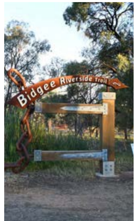
Location: Hay, Bidgee Riverside Trail located on Crown land featuring large public sculptures

Consultation summary report for Crown land 2031