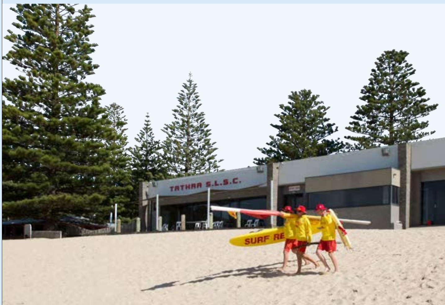
Location: Tathra Surf Club located on Crown land