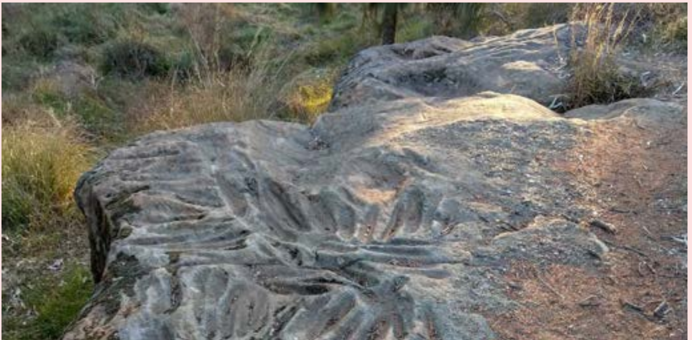
Location: Terramungamine Reserve is a site of historical significance with over 150 rock carvings

The department may also bring multiple parties together as required to broker more projects and find site-specific solutions.