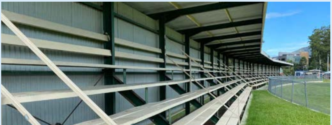
Location: Coffs Harbour Showground located on Crown land

Investments such as these allow the showground to respond to increasing demand and will serve the Coffs Harbour community well.