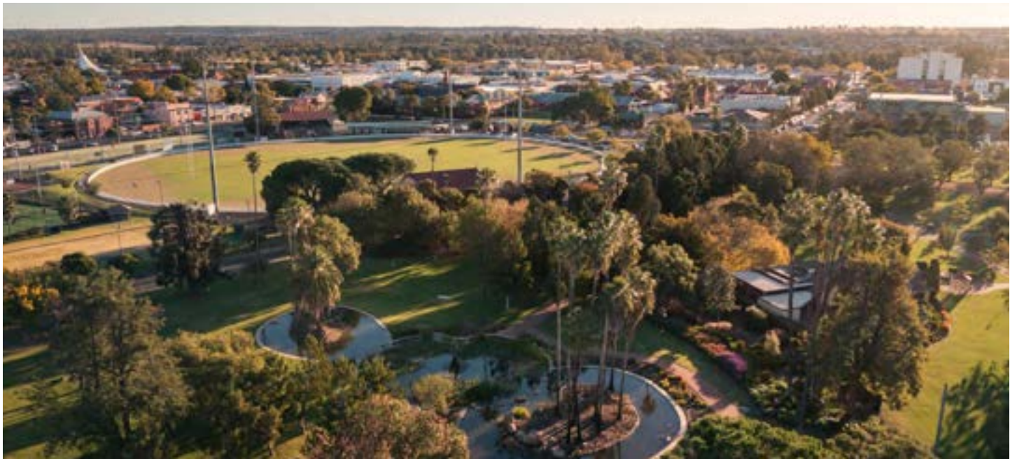
Location: Dubbo, Victoria Park located on Crown land