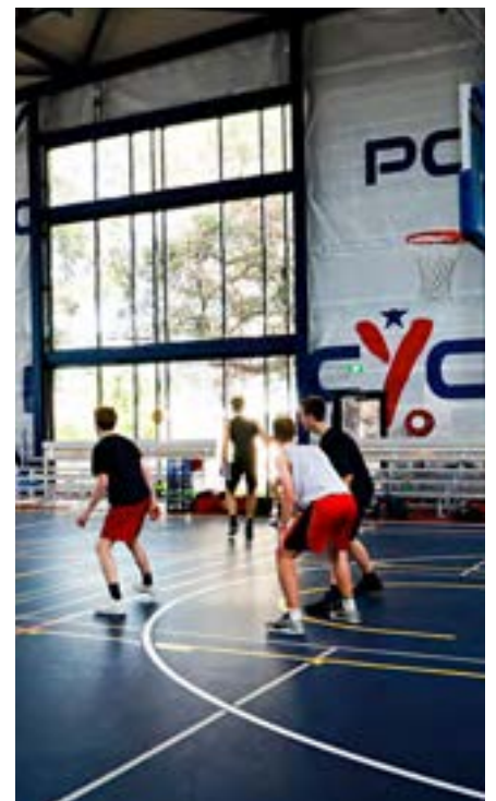
Location: PCYC Hornsby, multi-purpose facility located on Crown land

Consultation summary report for Crown land 2031