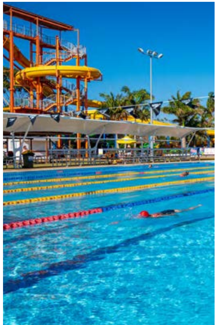
Location: Ballina memorial pool located on Crown land

Visit industry.nsw.gov.au/lands for updates on the department's progress.