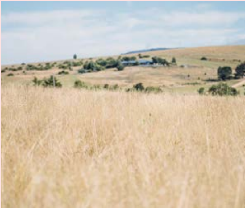
Location: Overlooking Crown land site that will support up to 200 homes to respond to housing shortages in Cooma NSW