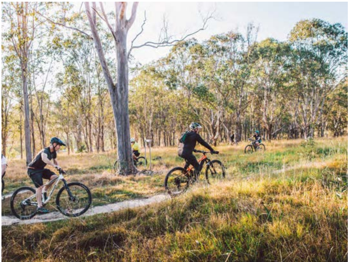
Location: Dungog Common, a historic agreement between the NSW Government and Karuah Local Aboriginal Land Council, has secured Dungog's future as a national mountain biking destination