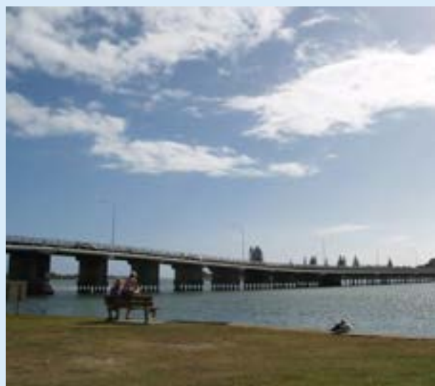
Location: Wallis Lake, Lone Pine Memorial Park on Crown land overlooking Coolongolook River estuary

Over time, more publicly accessible portals will be developed and linked to the CrownTracker system to create a one-stop-shop for all Crown land information.